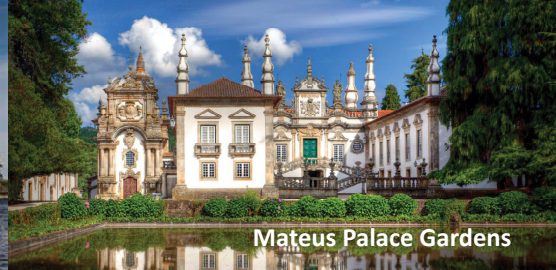
Mateus Palace Gardens