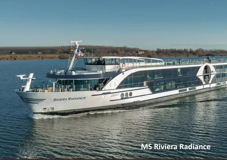
MS Riviera Radiance