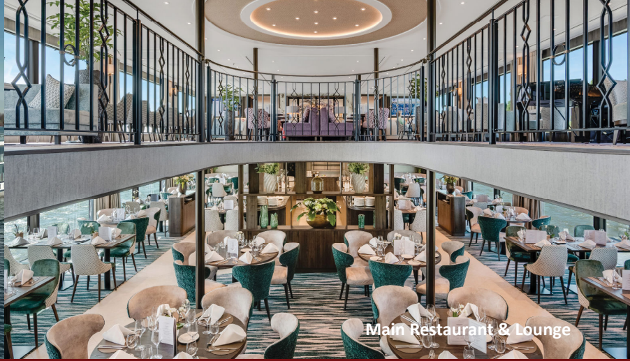
Main Restaurant & Lounge